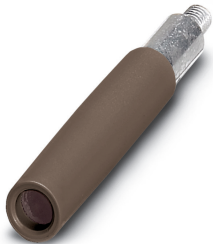
Female test connector, color: brown

Please be informed that the data shown in this PDF Document is generated from our Online Catalog. Please find the complete data in the user's documentation. Our General Terms of Use for Downloads are valid ( http://phoenixcontact.com/download )